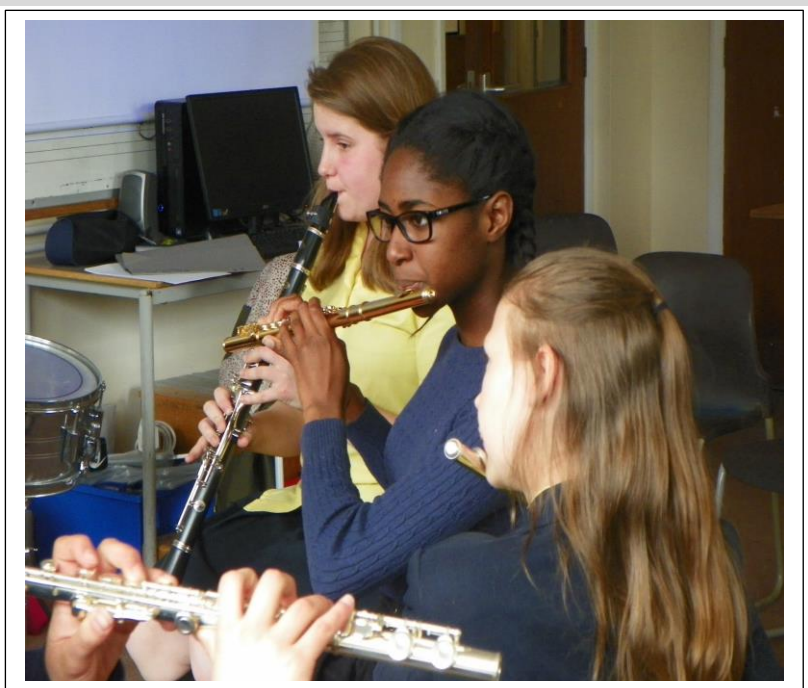
"Music is the universal language of mankind." Henry Wadsworth Longfellow